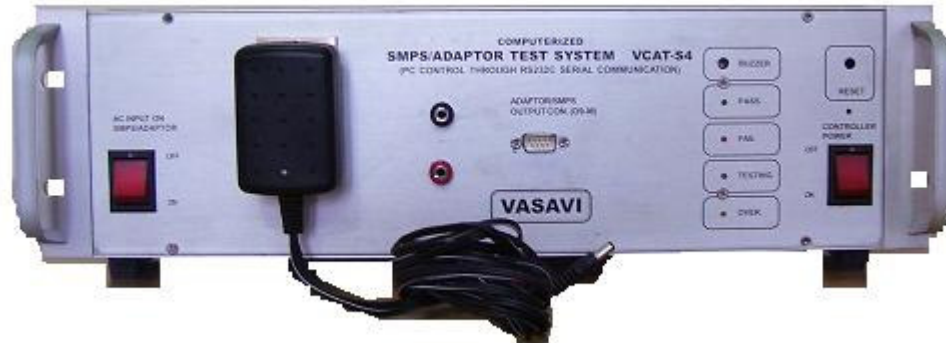
AUTOMATIC TEST EQUIPMENT (ATE) FOR ADAPTERS

Fast and easy testing of SMPS/Adaptors. Most ideal for mobile charges, battery charges, SMPS etc. Scans at one stock all the parameter of each and every output as per pre-defined program of the test procedure. Any semiskilled and unskilled person can be engaged in actual test. The person testing neednot have any knowledge of the parameters being tester, he ultimately has to see PASS/FAIL. In the software you can select the parameter to be tested , can select the channel under test ,can select the input voltages and also can select whether the test is to be done in loaded condition or without Load. The load is the programmable DC load you can enter any value <1Amp DC. The test parameters include Vdc, Vac , Idc, Iac, Programmable DC Load, Selectable INPUT voltage 100Vdc, 230Vac, 300Vac.