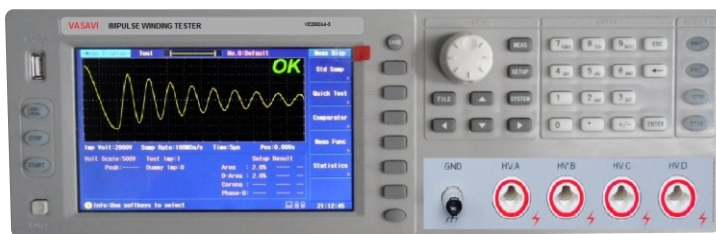
Multi Channel Impulse Winding Tester