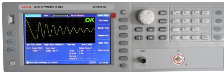
Single Channel Impulse Winding Tester